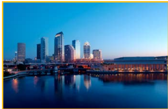
Tampa skyline with convention center at right.

Begin making your plans now for the 2008 ASI International Convention in Tampa, Florida, August 6-9. Online registration is now available on the ASI website, www.asiministries.org , where you can also find hotel reservation information and other convention news.